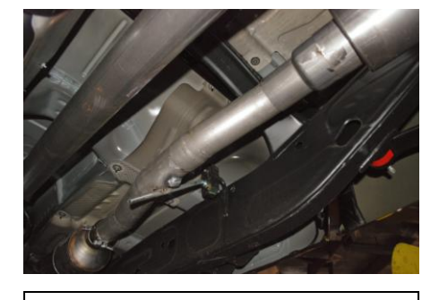
3. Use clamp Item # E to connect the muffler assembly to the headpipe.

2. Install head pipe Item # A onto the two bolt factory flange. Do not tighten. Insert hanger in to rubber grommet tailpipe